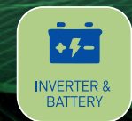
INVERTER & BATTERY