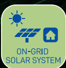
ON-GRID SOLAR SYSTEM

Presently we offer the digital security system, Automation and Renewable Energy including BLDC MOTOR, AC, FAN, CCTV, VIDEO DOOR PHONE, SECURITY ALARM, ACCESS CONTROL SYSTEM, TIME & ATTENDANCE SYSTEM, LIGHTNING ARRESTERS AND SURGE PROTECTION, AUTOMATION FOR GATE, SHUTTER, AND OFF/ON GRIDE SOLAR SYSTEM, SOLAR STREET LIGHT, SOLAR GARDEN LIGHT, WATER HEATER, UPS, INVERTERS, BATTERY, COPMUTER, LAPTOP, and IT Accessories with most modern international brands.