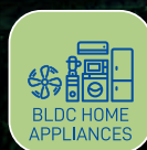
BLDC HOME APPLIANCES