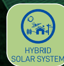
HYBRID SOLAR SYSTEM