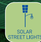
SOLAR STREET LIGHTS