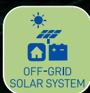
OFF-GRID SOLAR SYSTEM